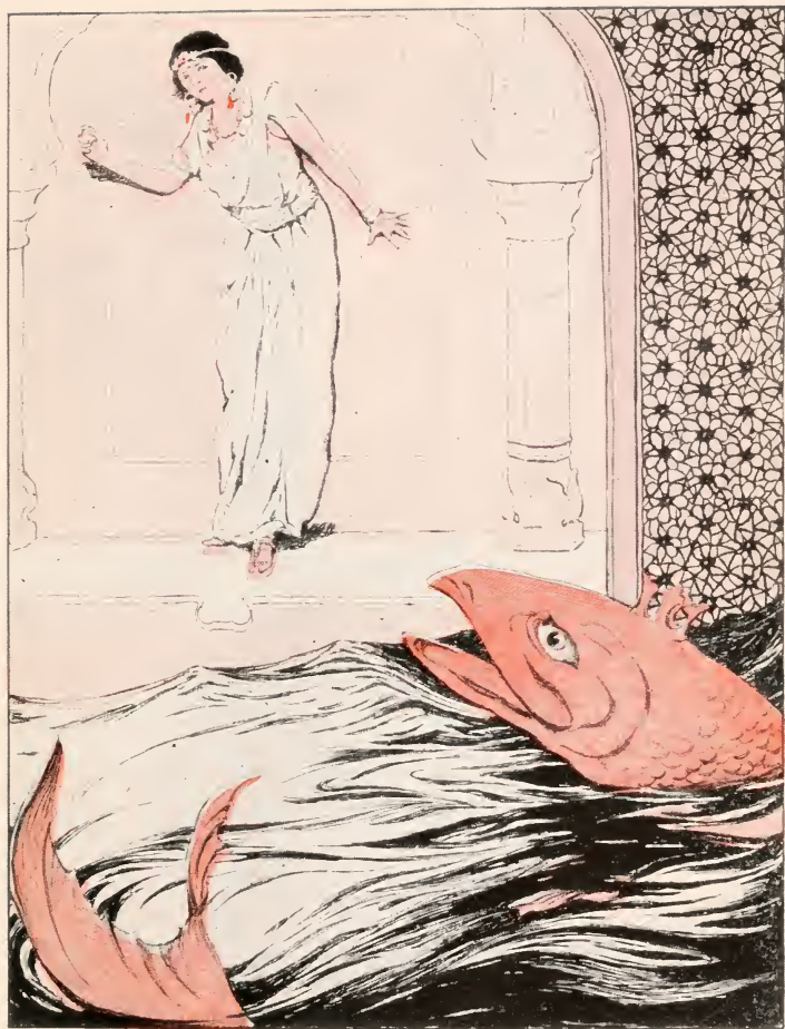
She managed to throw the third stone at him. Page 189